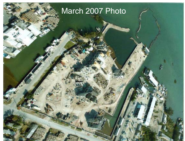
March 2007 Photo