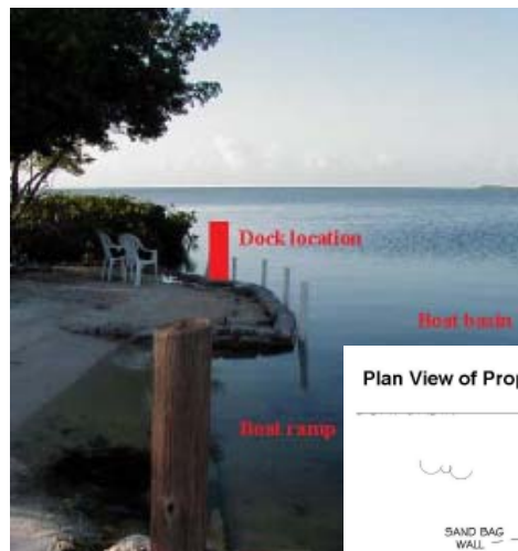
FIGURE B Plan View of Proposed Dock Showing Mangrove Line