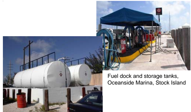
Fuel dock and storage tanks, Oceanside Marina, Stock Island